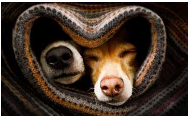
Bundle up! It's Winter!