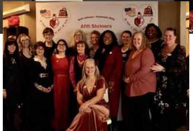
Gateway Shrine Club January Dinner