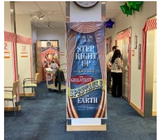
The volunteers are part of the Admissions Dept. Their theme this year was 'Circus'.

(d) Notice. At least one week prior to the annual meeting or any election, the temple Recorder shall mail to each member a notice thereof containing this section.