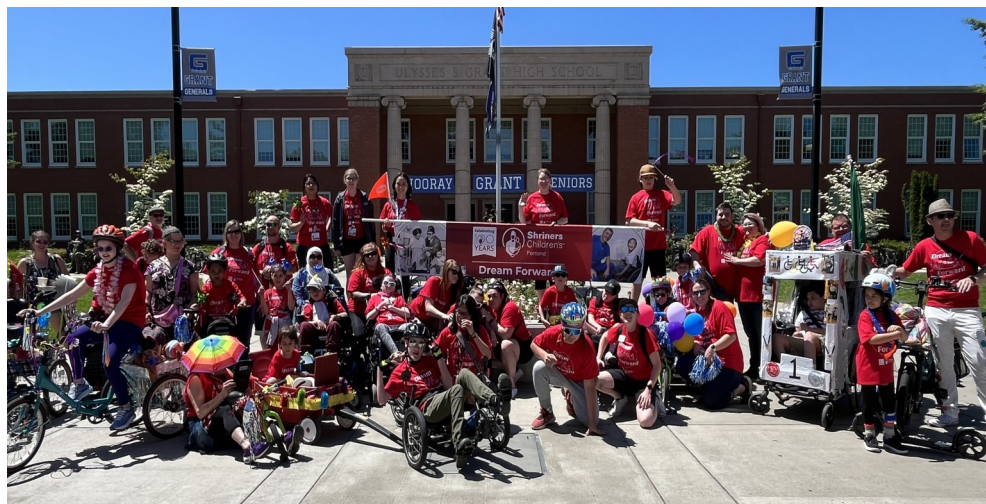
T-shirts for the Shriners Children's—Portland entry in the Portland Rose Festival Children's Parade provided by