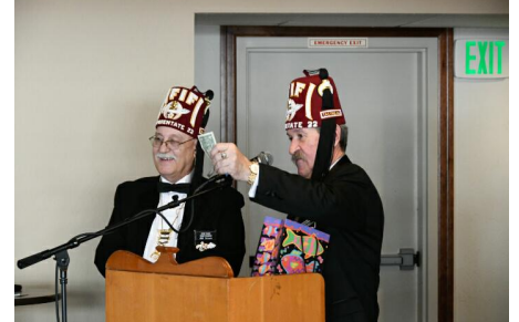
Presentation to our New Potentate by our Junior Past Potentate