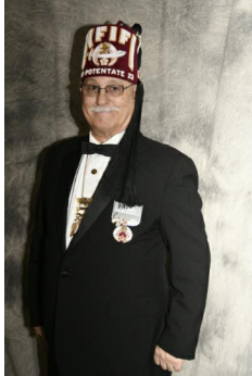
Illustrious Sir Don Varo 2023 Potentate