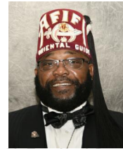
Noble TomaHawk Perason Oriental Guide