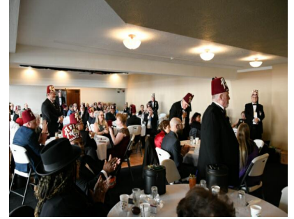
Attendees to our Installation, Lunch and Presentations