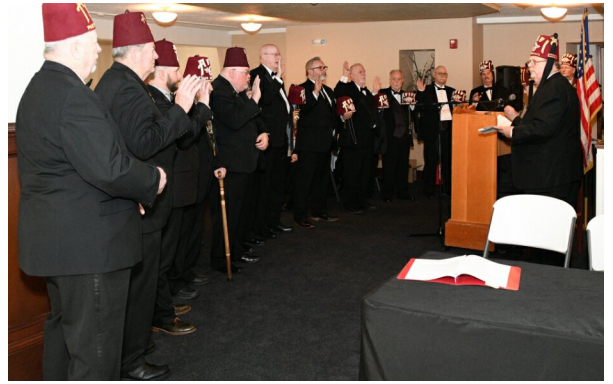
2022 Elected & Appointed Officers