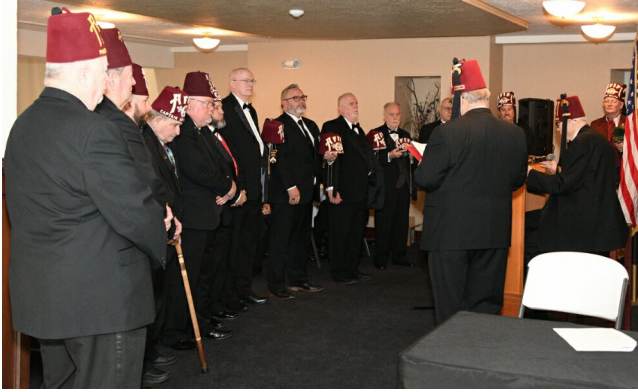
2022 Elected & Appointed Officers

https://wa-masonicphotos.smugmug.com/Shrine-Archive/Affi-Tacoma/2022-Events/2022-Affi-Shrine-Annual-Meeting-and-Installation