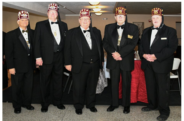
Past Potentates at the Installation