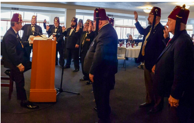
2022 Club & Units Officers